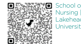
School of Nursing | Lakehead University

The review of applications will start September 2024 and will continue until the positions are filled. Please visit www.lakeheadu.ca for further details.